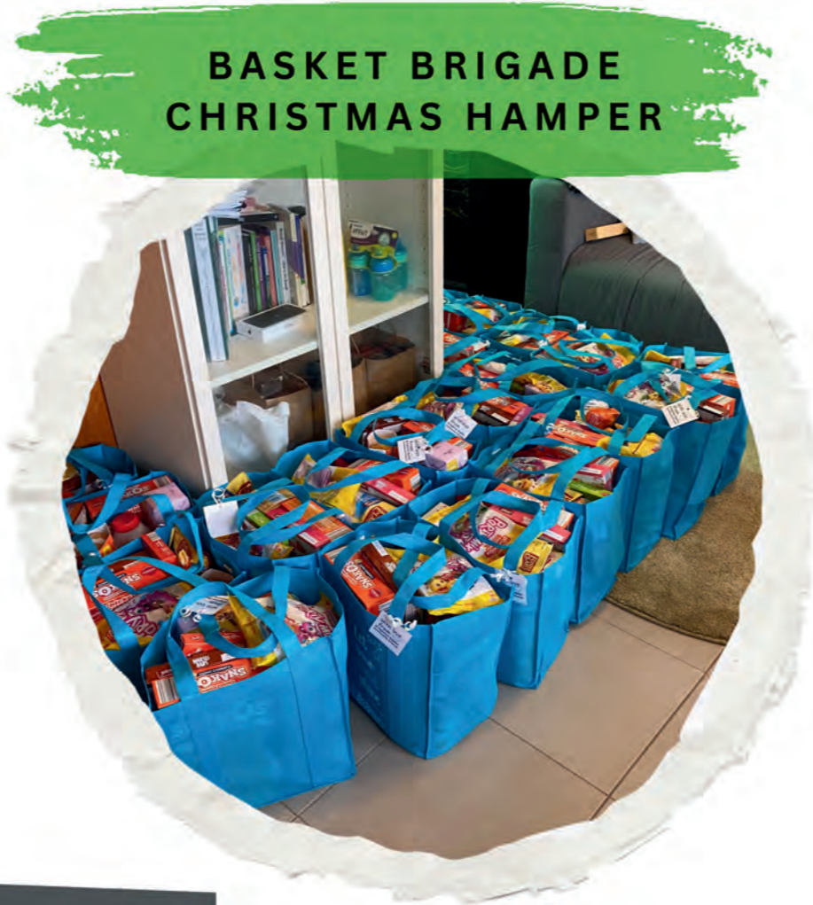
BASKET BRIGADE CHRISTMAS HAMPER