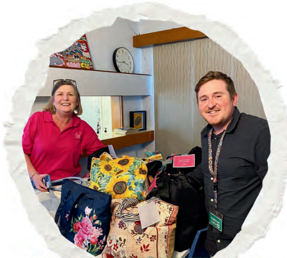
SHARE THE DIGNITY BAGS