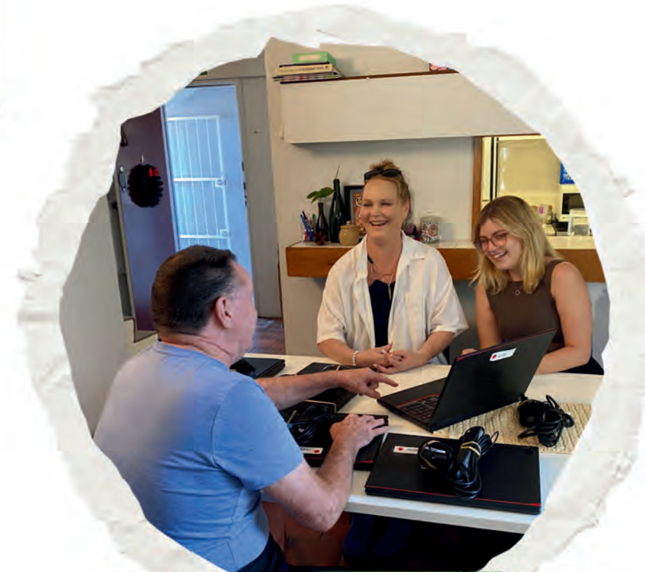
THE PARISH COMPUTER PROJECT - NUNDAH